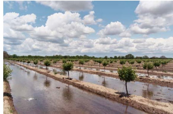
Fig. 3. Border irrigation on young trees.

In border irrigation, a field is divided into strips separated by border ridges running down the slope of the field. The width of the strips is usually from 20 feet to 100 feet. The area between the ridges is flooded during irrigation. Border irrigation is used for tree crops and for crops such as alfalfa and small grains (Fig. 3). In basin irrigation, a field is divided into sub-units or basins separated by border ridges, but the ground inside each basin is level. During irrigation, the basins are filled with the desired amount of water, and the water remains ponded within the basin until it infiltrates into the soil.