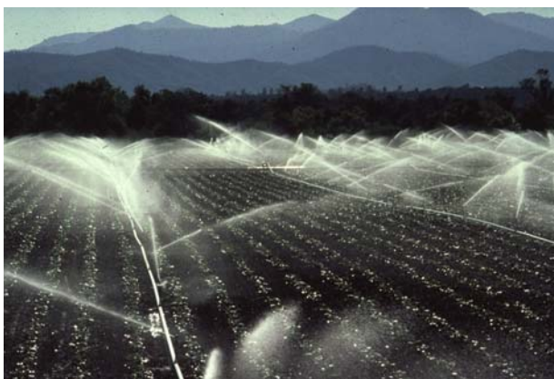
Figure 4. Sprinkler irrigation on vegetables.

In sprinkler irrigation (Fig. 4), water is applied throughout the field by means of rotating sprinklers or mini-sprinklers connected to a pressurized pipe system. Sprinklers spread water over a radius of 5 feet to 300 feet depending on design. The pipe system supplying the sprinklers can be permanent, moveable (either continuous-move or periodic-move), portable, or a combination of the three, and the system can be operated either automatically or semi-automatically.