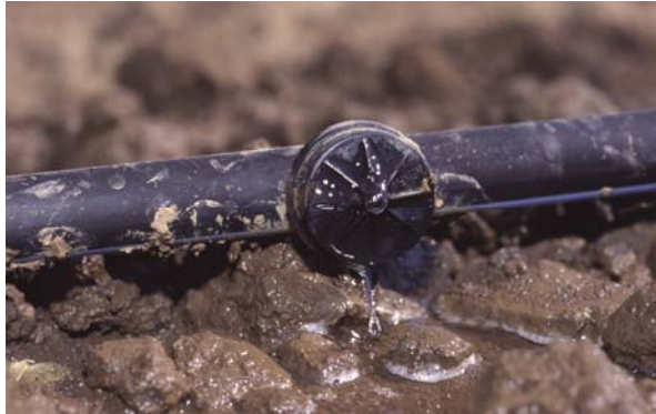
Figure 5. Drip irrigation emitter.

In microirrigation , water is applied to the plants through emitters so that water leaves the emitter as a droplet. Water is supplied to the emitters (drippers or microsprinklers) (see fig. 5) through a network of mainline and lateral pipelines that are usually made of plastics. A head unit is used to regulate pressure, filter the water and add nutrients (see fig. 6).