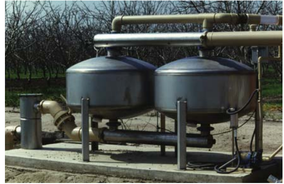
Figure 6. Drip irrigation filters.