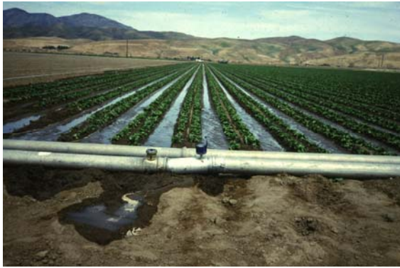
Fig. 2. Furrow irrigation using gated pipe

irrigation. In furrow irrigation, small channels or furrows are used to convey water across a field, and the water infiltrates through the bottom and sides of the furrow, wetting the nearby soil (Fig. 2).